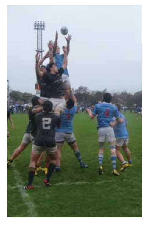
The true character of a young side was very evident as the First XV defeated Wellington College to win the Wellington Premier 1 Rugby Final.