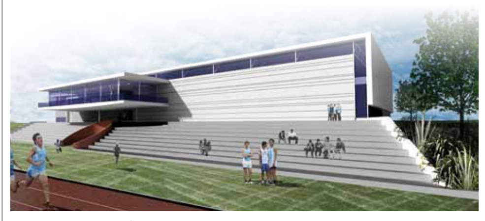
Artist's impression of the new gym.

"The Sports Hub will give the College a unique facility that will benefit generations of St Pat's students to come."