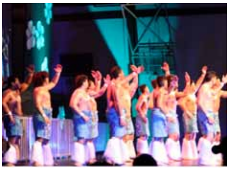
Stream's Polynesian Group participated in the Annual HuttFest at Walter Nash Stadium, Lower Hutt.