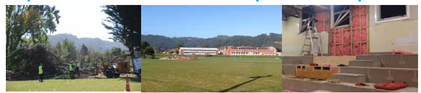
Trees removed from boundary between No 3 Rugby and recently established soccer pitch on land behind the Home of Compassion.