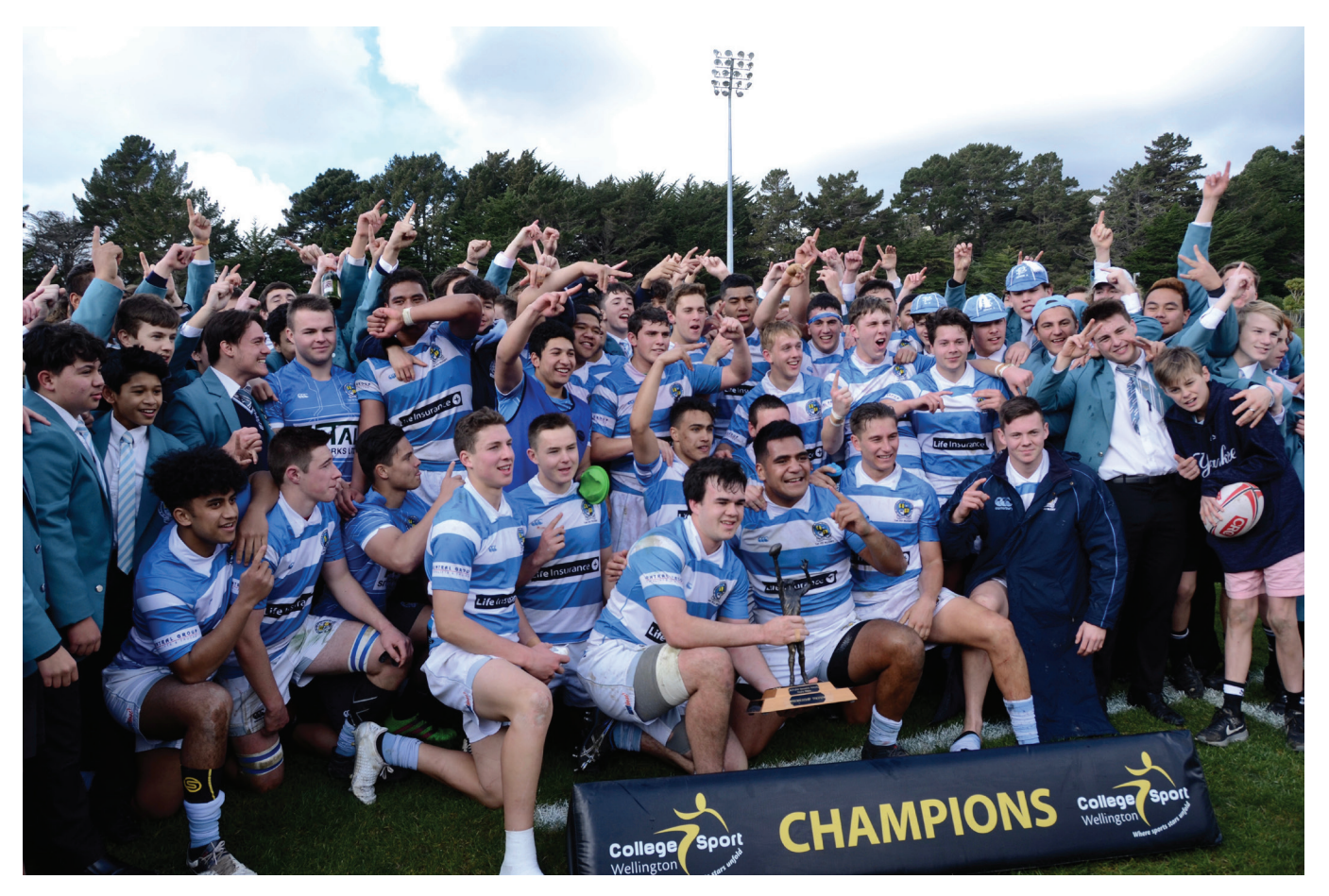
The winning 1st XV taking out the College Sport Wellington Premiership for the second consecutive year.