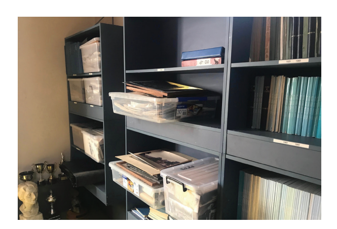
The archives storage room (small priests chapel) Orginal photo albums and back copies of Blue and Whites.