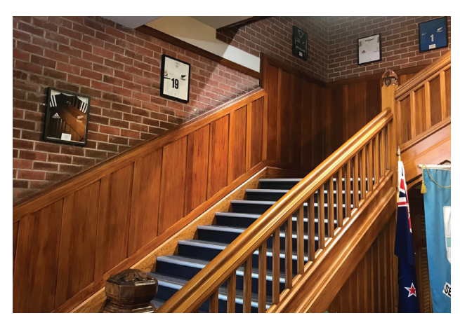
The main stairwell with attached memorabilia