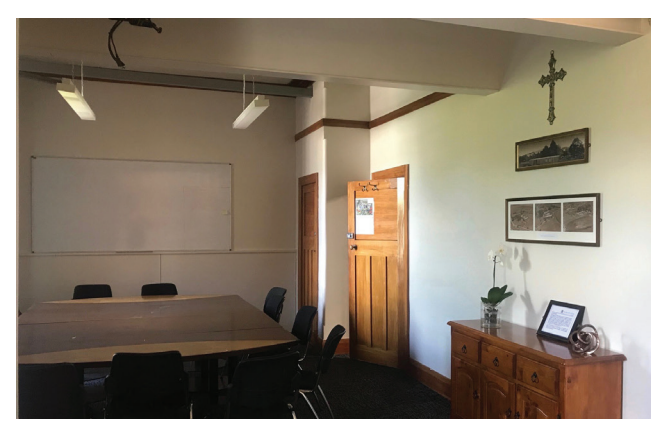
New boardroom and attached historical photos. This area was originally two bedrooms when Dowlng block was the main dormitory of the College